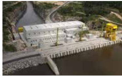
Côte d'Ivoire Soubré Hydroelectric Verified to Verra VCS by 4K Earth Science Private Limited