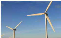
Jamaica Wigton Windfarm Verified to the UNFCCC by SGS Climate Change Program

Using our service you can support meaningful carbon reduction projects that we have carefully selected for our clients. These include renewable energy power projects and coastal marine ecosystem projects situated in coastal or island locations. We only work with projects that are validated by International Registries. Here is a sample of the projects we support.