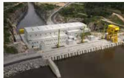
Côte d'Ivoire Soubre Hydroelectric Verified to Vera VCS by 4K Earth Science Private Limited