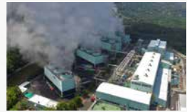
El Salvador Berlin Geothermal Verified to the UNFCCC by ICONTEC

For details of all current projects, please visit our website: www.yachtcarbonoffset.com .