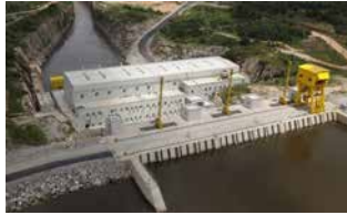
Côte d'Ivoire Soubré Hydroelectric Verified to Verra VCS by 4K Earth Science Private Limited