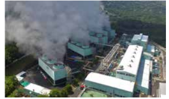
El Salvador Berlin Geothermal Verified to the UNFCCC by ICONTEC