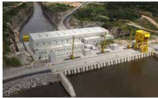
Côte d'Ivoire Soubré Hydroelectric Verified to Verra VCS by 4K Earth Science Private Limited