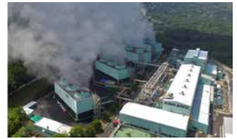
El Salvador Berlin Geothermal Verified to the UNFCCC by ICONTEC