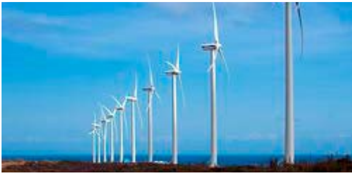
Aruba: Wind power, on east coast of Island Verified to Gold Standard by Earthood Services