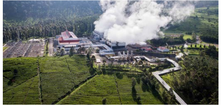
Indonesia: Geothermal power, West Java Verified to VCS by TUV Nord

For details on all projects selected by Yacht Carbon Offset, visit the project page on yachtcarbonoffset.com