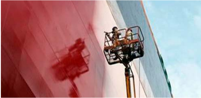
International Shipping: Advanced antifouling Verified to Gold Standard by RINA S.p.A