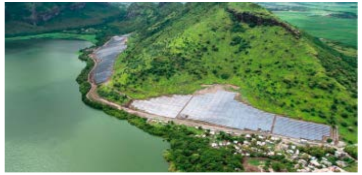
Mauritius: Solar power, western part of Island Verified to VCS by Carbon Check Pvt. Ltd